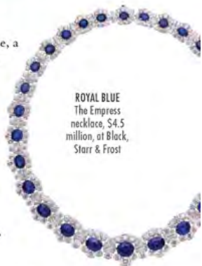
ROYAL BLUE The Empress necklace, $4.5 million, at Black, Starr & Frost